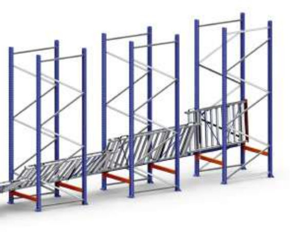
Four of the channels fold up to allow cleaning and maintenance to be done.

Pallets are grouped according to if they correspond to a particular order or route, aiming to speed up subsequent distribution vehicle loading which minimises wait times.