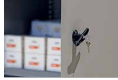
The doors include a lock with two keys.