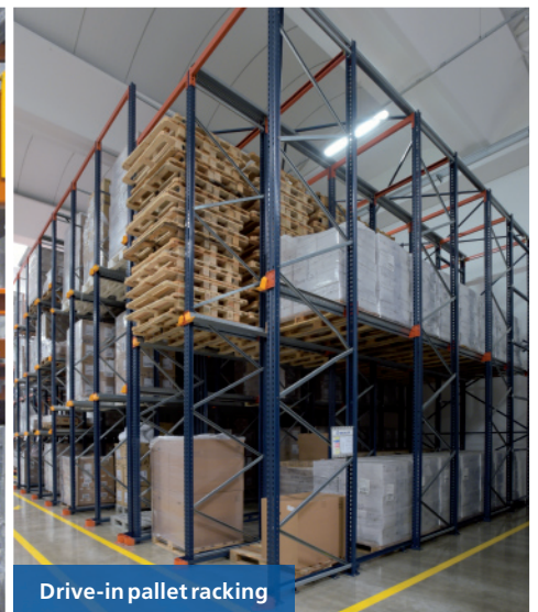
Drive-in pallet racking