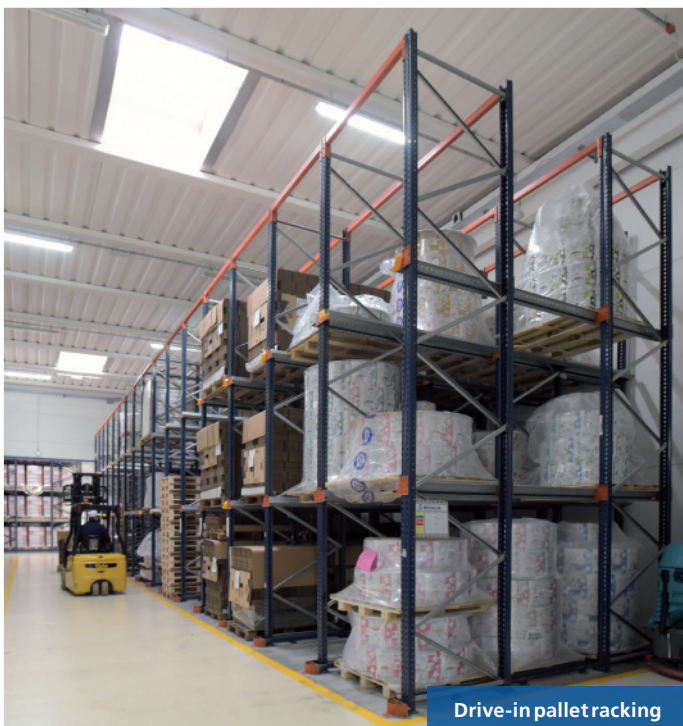
Drive-in pallet racking

for goods that remain in quarantine, i.e., stored during a certain time while awaiting its verification and the performance of quality controls. Once each pallet passes this imperative phase, it is sorted depending on its turnover and it is assigned a location.