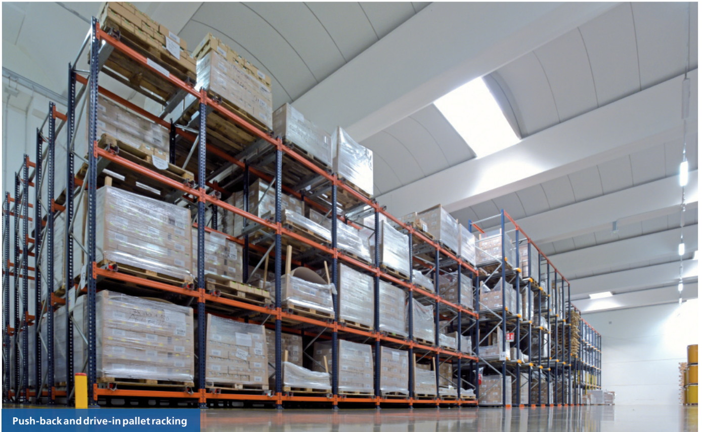
Push-back and drive-in pallet racking