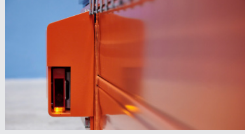
Proximity photocells ensure a smooth, safe stop.

manage the raw materials: pallet racks and a Movirack mobile pallet racking unit. "We chose Movirack racking because we realised it would make the most of the available space. We were convinced by how easy this storage system was for managing goods and by the excellent manufacture of its structure," says Tenzi.