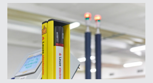
Exterior barriers stop the racks from moving when an operator enters the aisle.

Movirack mobile pallet racking ensures completely safe movements, as it is equipped with several safety devices: